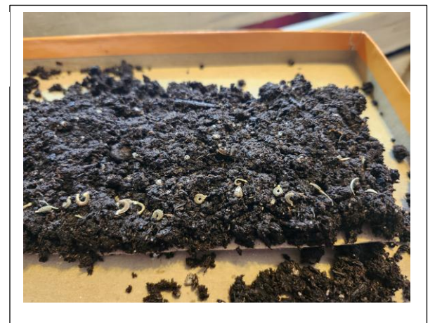
Place seeds appropriate depth from the top edge (Pictured: Calendula), don't plant the last 2 inches, remove soil