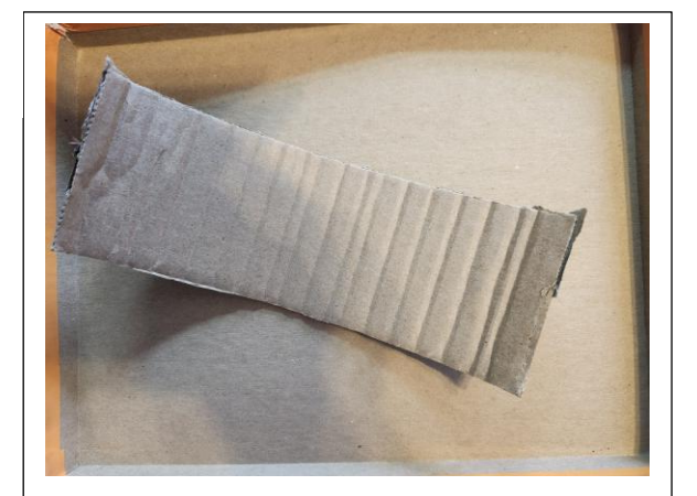
Heavy Paper or Cardboard 4-6" deep, 8-12" long, pre-roll the cardboard