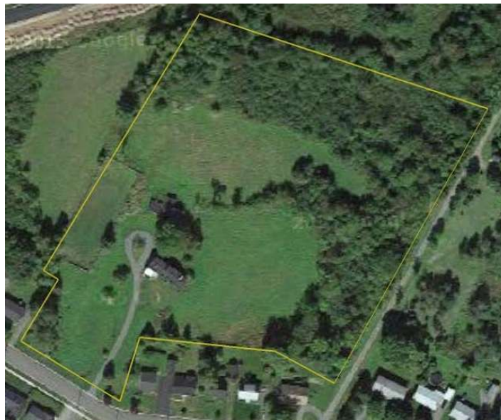
Anticipated land use – Hayes Urban Teaching Farm